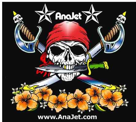
PIRATE (10 x 9.07 in)