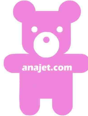
BEAR (10 x 8.34 in)