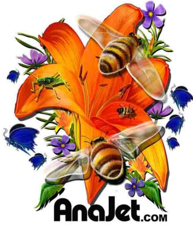
BEE (10 x 8.7 in)