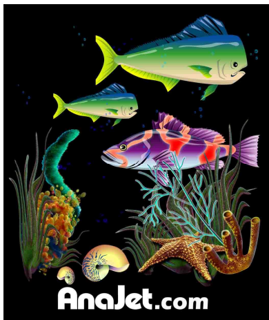
FISH (7.8 x 10 in)