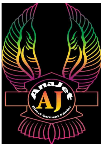
EAGLE (10 x 7.05 in)