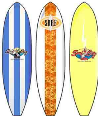
SURFBOARDS (8.68 x 10 in)