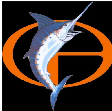
LOGO (10 x 10 in)