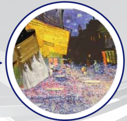
Step 3: Apply ARTprint Texture Coat™.