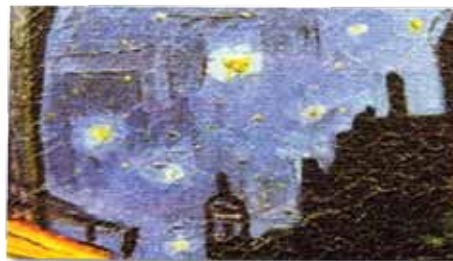
Enlarged view of Texture Coat