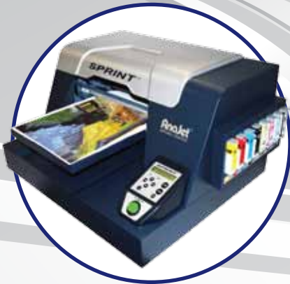
Step 1: Print your image on ARTprint Canvas™.